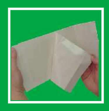
Peel Release Paper

Safe for use in food-handling and food storage areas. Place out of reach of children and pets.