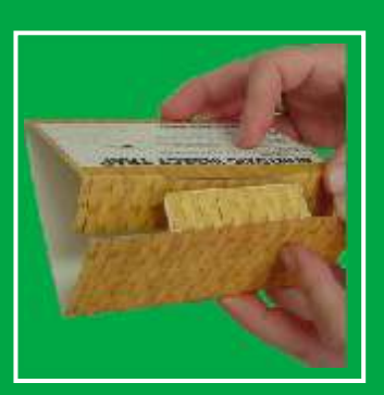
Tuck Tab to Assemble