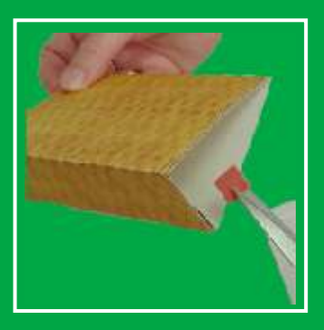
Place Lure in Trap